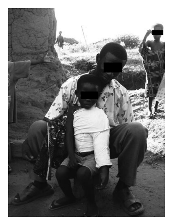
Figure 4 Child with a broken left upper arm, bandaged position.