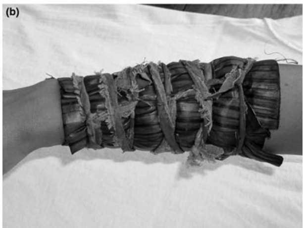
Figure 3 (a) A bandage of plantain leaves; (b) the dried herbs under the bandage.

limbs are preferably bandaged in an extended position (Figure 4). The reason for that remained unclear to us. The upper leg contains two bones (?!), in contrary to the lower leg (?!). Most of the times, only one bone is broken, and so a fracture of the upper leg doesn't need a splint. The lower leg always needs a splint for stabilization (Bonesetter).