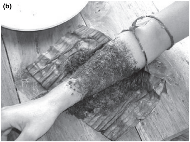
Figure 2 (a) and (b) Dried herbs are applied on the broken limb.