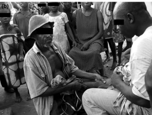
Figure 1 (a) Shea butter is applied on the affected limb; (b) massage of the affected limb.