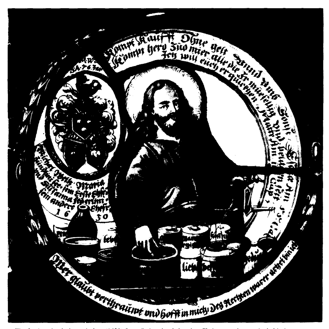
Fig. 2. A stained-glass window (1630) from Switzerland showing Christ as a pharmacist behind a counter filled with Christian virtues as medicines (Schweizerisches Landesmuseum, Zürich).

[15]. Texts which pronounce that God or Jesus take care of people's physical health abound in both Testaments, but they do not yet touch the essence of the devotional theme. Jesus heals the blind, the lame, the crippled, the deaf and dumb, the mentally disturbed people, lepers and epileptics, yet true devotional inspiration is derived from his remark that spiritual health is infinitely more important than a healthy body. From that moment on his ability to heal physically becomes an index of his spiritual power. In Matthew chap. 9 Jesus forgives a lame man his sins. Some onlookers accuse him of blasphemy. Matthew continues: