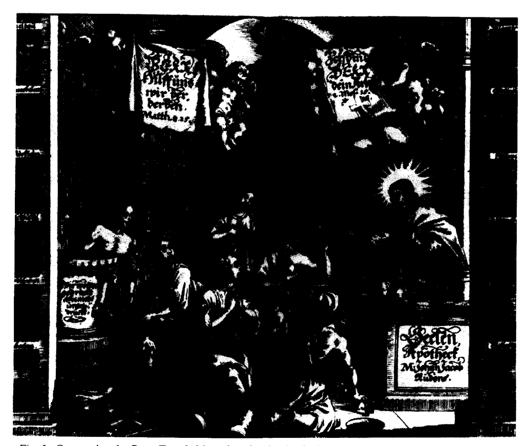
Fig. 3. Copperplate by Peter Troschel in a devotion book "Seelen-Apotheck" (1653) written by Johann Jacob Rüden, preacher in Mürnberg.

By the seventeenth century the 'Pharmacy of the Soul' had established itself firmly in German folk devotion. The number of prayer and meditation